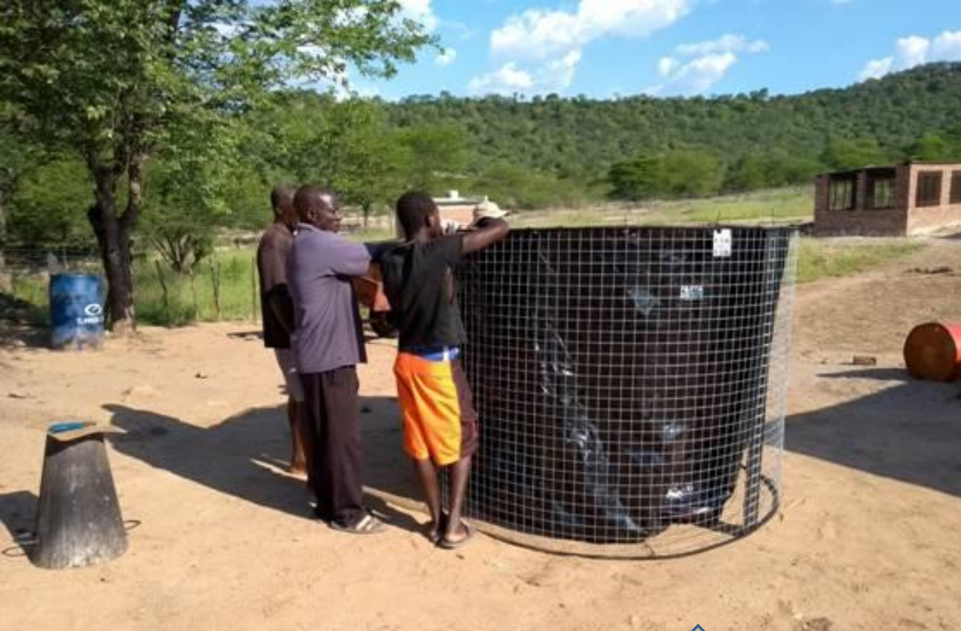
Assembling the Portatank as per easy instruction manual